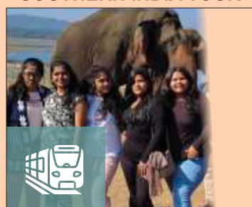
SOUTHERN INDIA TOUR