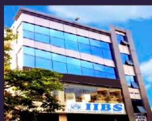
R.T. Nagar Campus Bengaluru