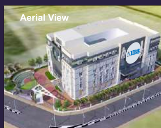
Airport Campus Bengaluru