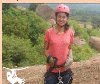
ALP (ADVENTURE LEARNING PROGRAM)